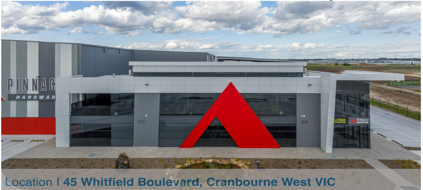
Location | 45 Whitfield Boulevard, Cranbourne West VIC